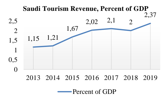
Graphic 3. Percentages of Saudi Arabia's Tourism revenue

sites important to Muslim (Kingdom et al., 2016). By looking back at the goals of Vision 2030, namely improving fund management, increasing investment, which impacts economic development, and creating a dynamic society, tourism is one of the prioritized sectors in Saudi Vision 2030.