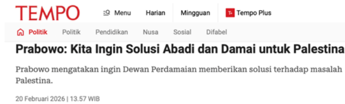
Figure 2. Prabowo: We Want a Lasting and Peaceful Solution for Palestine