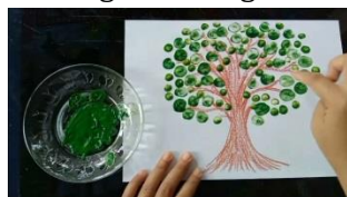
Figure 3 Finger painting activities give leaves to trees

In mixing colours where, if yellow and red become orange, yellow and blue become green, red and blue become purple and yellow, and red and blue then become brown. Then the teacher gave a picture using his fingers: "Children, after we finish mixing colours, we continue by drawing with fingers with the theme of drawing plants that give leaves to trees. Do your children like to draw leaves?" Mother introduced the theme with a singing activity entitled "Tree Section," and Gurur divided paper and dye that would be used to draw tree leaves using finger painting techniques. After the teacher finished distributing the equipment, the teacher explained the steps of drawing. "OK, children, first dip three fingertips a little, then stick it on paper and then do it until the tree has very dense leaves, just like the teacher's mother did. Can the children?" After the teacher explains and models the drawings, the children are told to follow the steps given by the teacher, and the teacher guides the children one by one while drawing fish using their fingers.