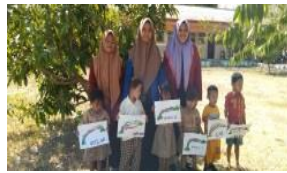
Figure 4 Rainbow finger painting activities

"Both children dip three fingers with different colours, any finger, namely the pointed finger, middle finger, and also ring finger, well then make a curved line as the teacher's mother did and become a rainbow".