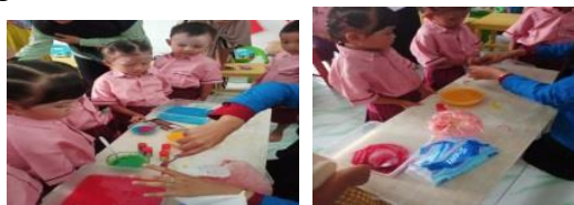
Figure 2 Finger painting activities Mixing colors

The first step of the teacher is to say the greeting "Assalamualaikum children" After that, it is continued by asking how it is doing, then reading the roll and asking today's peasant ", How are the children today?" then the teacher gives an overview of learning activities "Good children today we will draw from our hands, but before that who wants to help the teacher mother to mix colours because there are still three colours here there is yellow, red and also blue" rudder, Mrs Teacher invites her students to mix colours, "Who wants to help you to mix colours?" it turns out that all children participate in mixing colours.