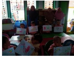
Figure 6 Presentation of Children's Work

Assessment of students is carried out regularly and continuously (Mayar et al., 2022), so assessment is an essential activity in the program at KB Nurul Barokah. This is based on the results of observations and interactions with informants that researchers have carried out in applying finger painting activities to strengthen children's fine motor skills. Teachers and researchers conducted a learning evaluation to determine children's acceptable motor development level after applying finger painting activities. During the implementation of teaching and learning, teachers and researchers monitor children who are able to use their fingers well when doing finger painting. They also pay attention to the child's development during the learning process and monitor the activity of the child's fingers after doing finger painting activities. At the time of learning, teachers and researchers give value to children who actively follow activities well. In addition, they evaluated aspects of children's fine motor development, starting from the first to the third meeting, using finger painting activities until completion. Teachers and researchers assess by observing the results of children's activities. The evaluation is based on the ability of the fingers and precise and precise wrist movements (Siskawati & Syarah, 2020).