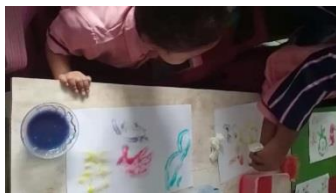
Figure 5 Finger painting activities, indulging according to children's preferences

The activity will be held on Wednesday, January 31, 2024